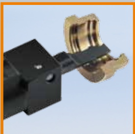
ID Grooving with WSI