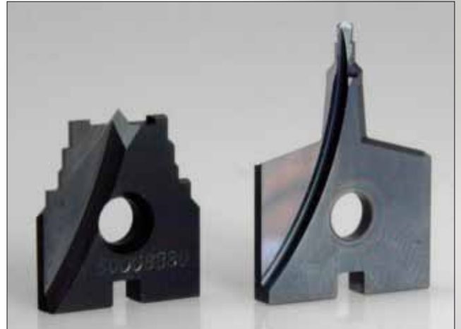
Sample applications: PWP-D-System

Form Drilling with Schwanog. Wider. More Efficient. Lower costs!