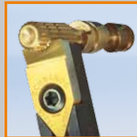
Broaches for Serrations