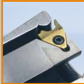
ID Grooving with PWP