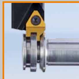
Rotary transfer machines