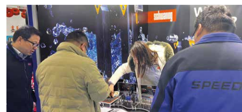
CME - International machine tool exhibition, China