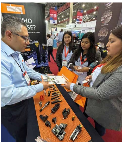
EXPO Manufactura, Monterrey