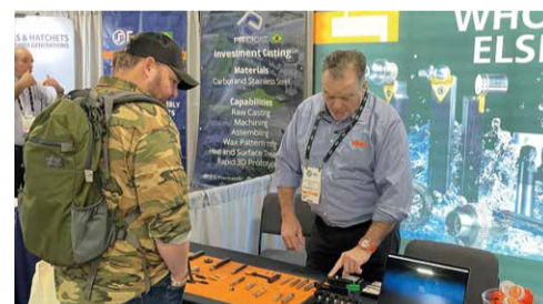
Shot Show, Las Vegas