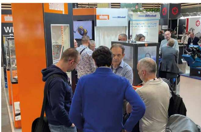
Simodec, La Roche-Sur-Foron

With the first trade shows in 2024, we were able to identify a clear trend with the desire for substantial productivity solutions. Our trade show teams enjoyed high visitor numbers - whether at the Shot Show in Las Vegas, NV, USA, Expo Manufactura in Monterrey, Mexico, Fornitore Offresi and Mecspe in Italy, Simodec in France, or the CME in China.