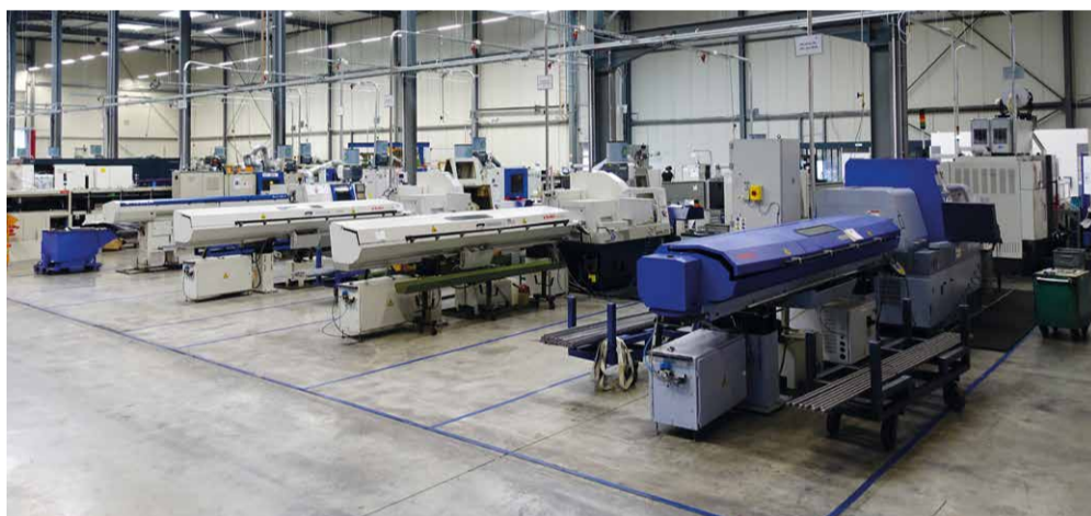
WIGGENTech's machine park consists of around 20 multi-spindle and single-spindle lathes

WIGGENTech would like to further strengthen its long-standing successful collaboration in the future and involve Schwanog in new projects wherever possible.