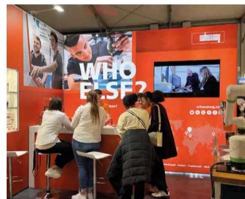
Jobs for Future, Job fair in Villingen-Schwenningen