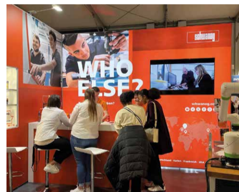
Jobs for Future, Job fair in Villingen-Schwenningen